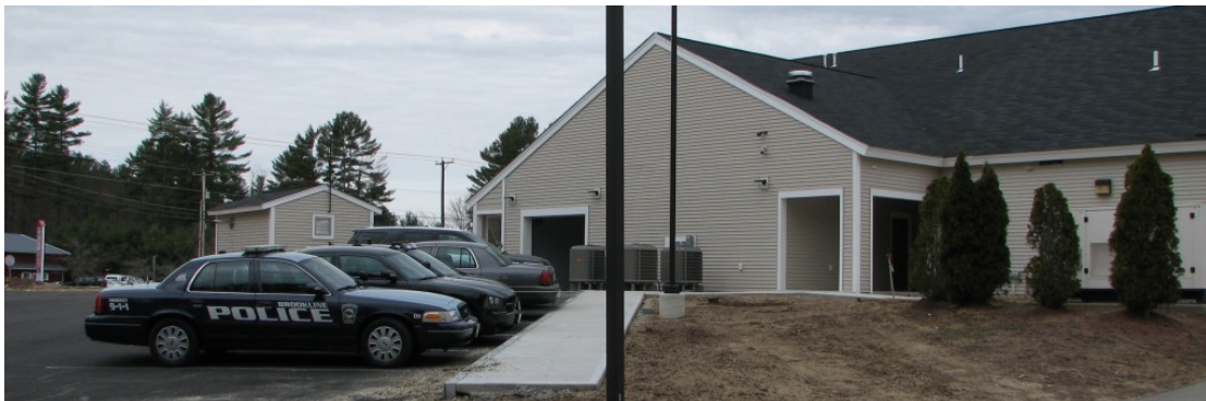
Brookline Safety Complex – Ambulance Service & Police Department