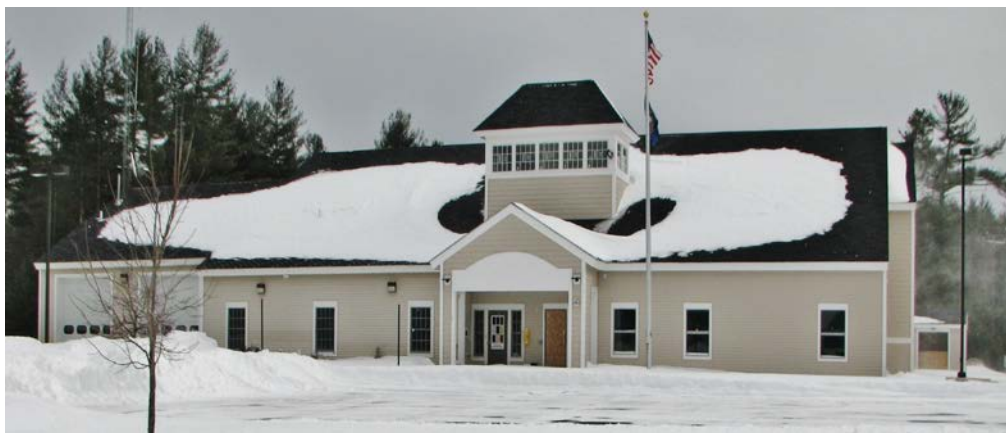
Brookline Safety Complex – Ambulance Service & Police Department

For more information, non-emergency services and staff roster, including email addresses, please visit our website: www.brookline.nh.us/ambulance-service