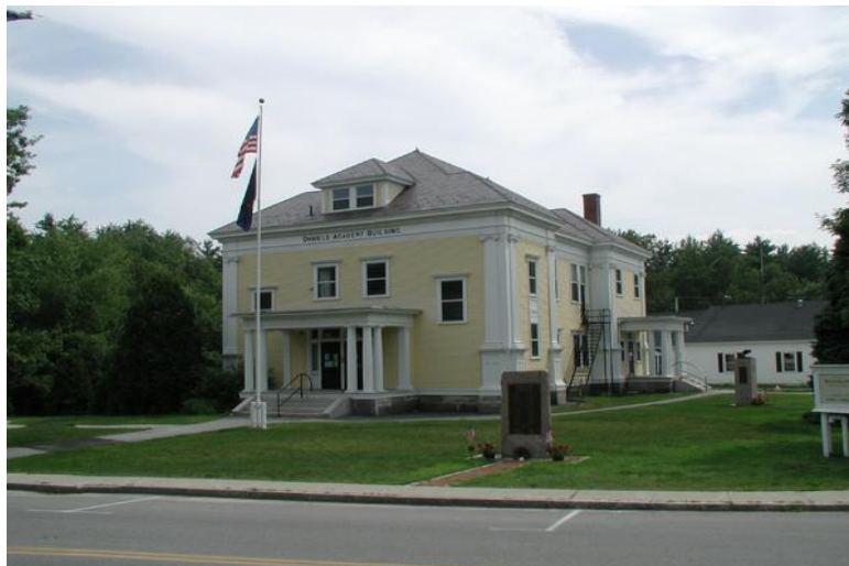
Brookline, NH – Town Hall (Daniels Academy Building)