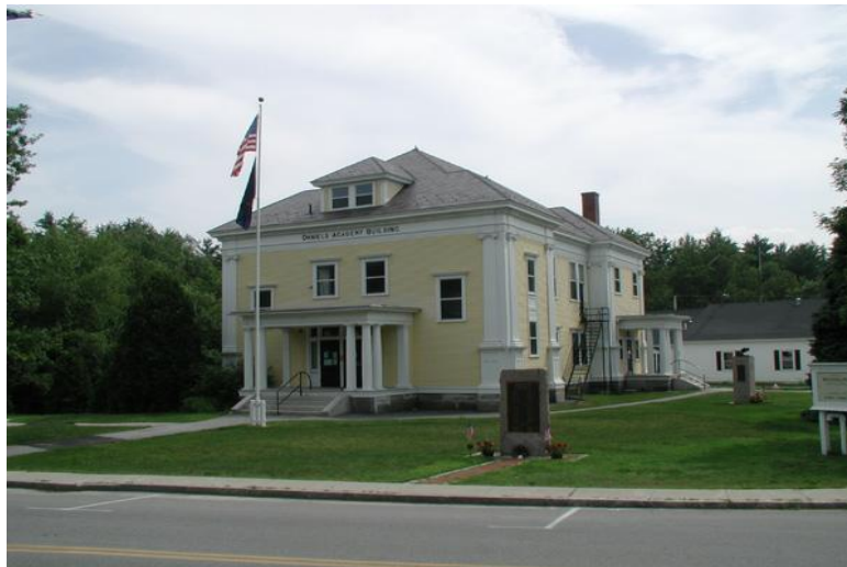
Brookline, NH – Town Hall (Daniels Academy Building)